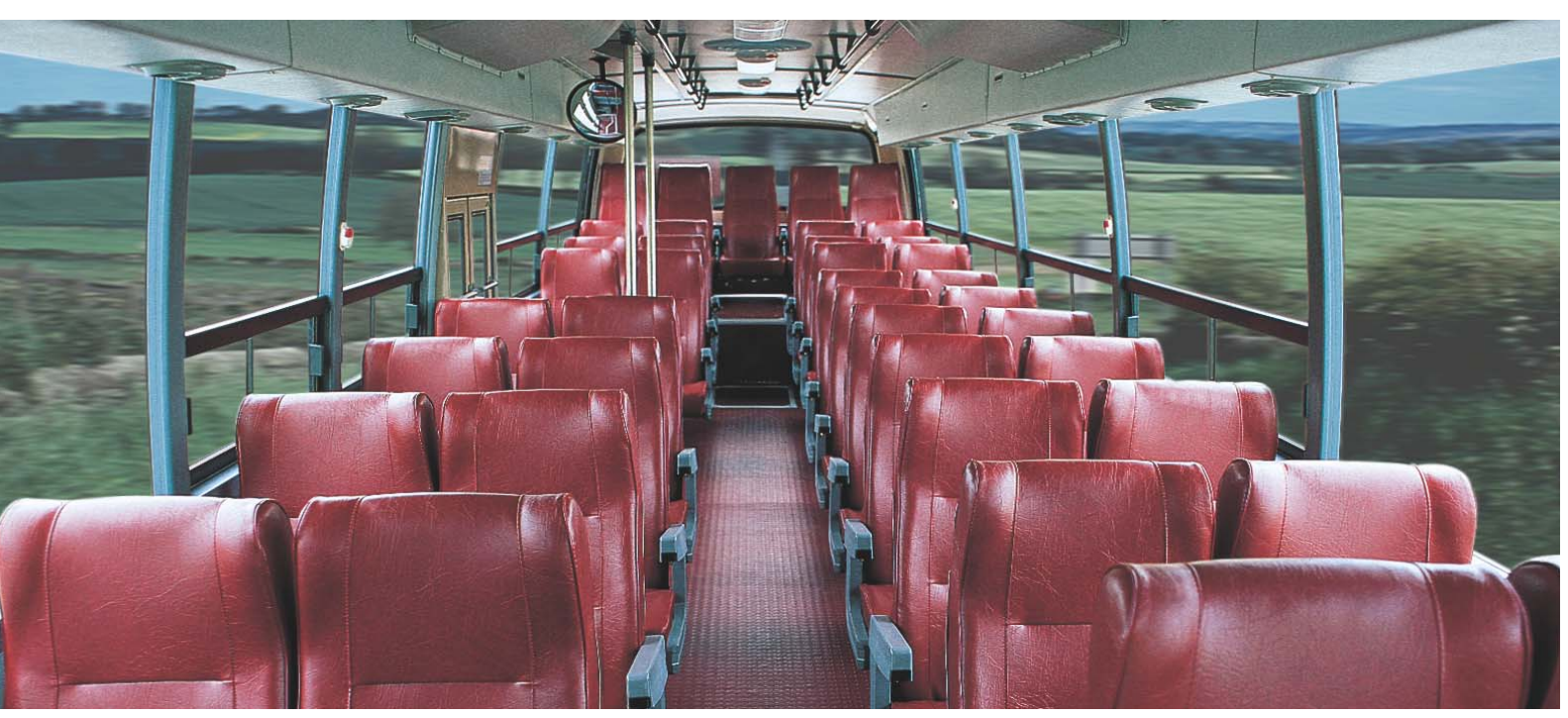
2 x 2 Seat arrangement with middle door